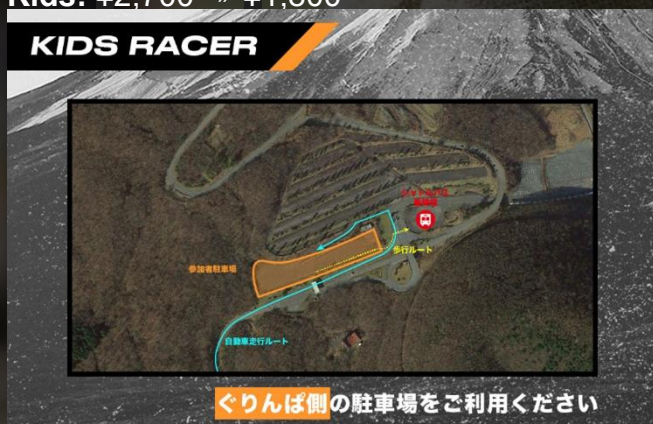
Example of Spartan Kids Grinpa Parking Ticket